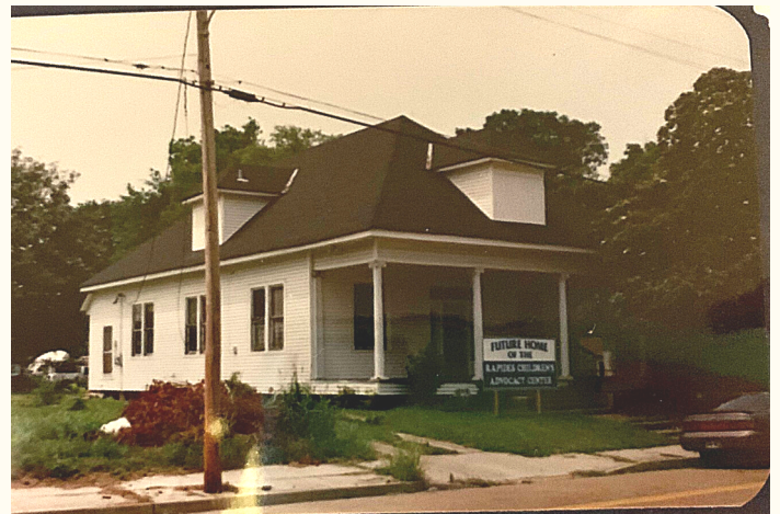
Rapides Children's Advocacy Center: BEFORE the Renovation Project Began

This year we reflected on those individuals who came together to address the needs of abused and neglected children. From humble beginnings in 1995, our vision took root through the collaboration of local professionals and the common vision to eradicate child abuse. The initiative spread across the region helping heal and champion abused and neglected children throughout Central Louisiana. As services expanded, we became the Children's Advocacy Network and continued improving responses to the child welfare system in order to ensure safe and successful futures for the children of our communities. Helping over 1,000 children each year, throughout our region, our vision is rooted in the vision and passion of many. Our collective efforts have made a lasting impact and we are continuously grateful.